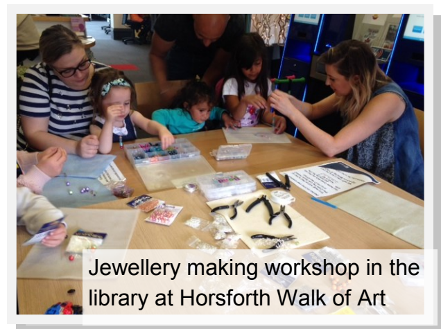
Jewellery making workshop in the library at Horsforth Walk of Art

Councillors continue to support the landmark Guiseley Clock Tower with £400 set aside to pay for the maintenance.