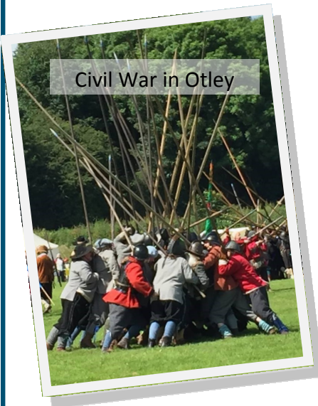
Civil War in Otley