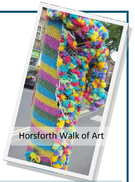
Horsforth Walk of Art

Community Committee is supporting the improvements to the toilets and loft insulation at Arthington Village Hall with a small grant. The new toilets will be more eco-friendly and will help the hall save money on heating bills.